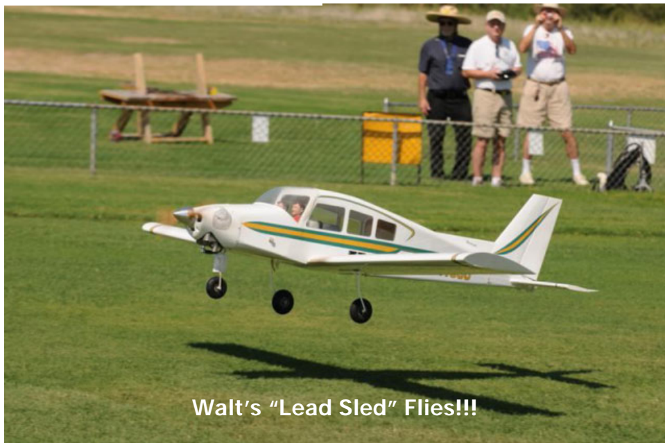
Walt's "Lead Sled" Flies!!!

The plane is an Aero Works ProX 60-90 with a DLE 20. I used Hitec 645mg for all the control surfaces and a HS 55 for throttle. The ignition is 4.8v, and receiver pack is 6v. The landing gear is nylon made by tetherlite. Aero Works makes a quality model with all necessary hardware to complete the build. The conversion to DLE required some mods to the fuse front, cutting out the slot for the carb and glueing in some balsa strips after the fuse was altered. They offer a template kit but I chose to save the $30 and copy and paste it into word to make my own. Notice the neat quarter turn hatch latches on the top of the wing making it easy to assemble at the field.