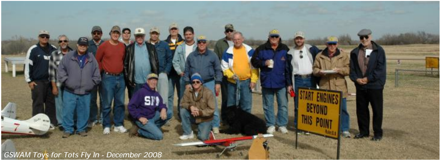
GSWAM Toys for Tots Fly In - December 2008