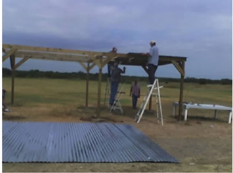
2005 - September 25 Greater South West Aero Modeler's Club Frequency/Channel Usage