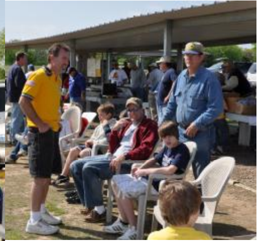
Food at lunch time was very popular!!