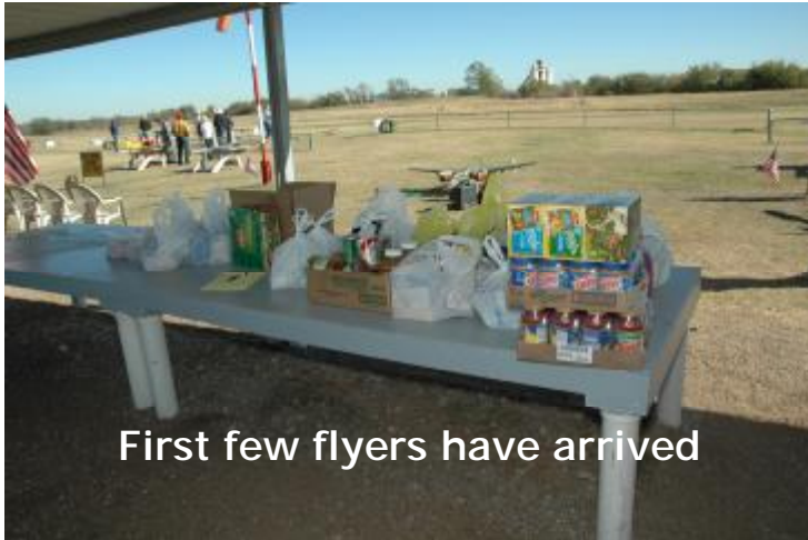
First few flyers have arrived