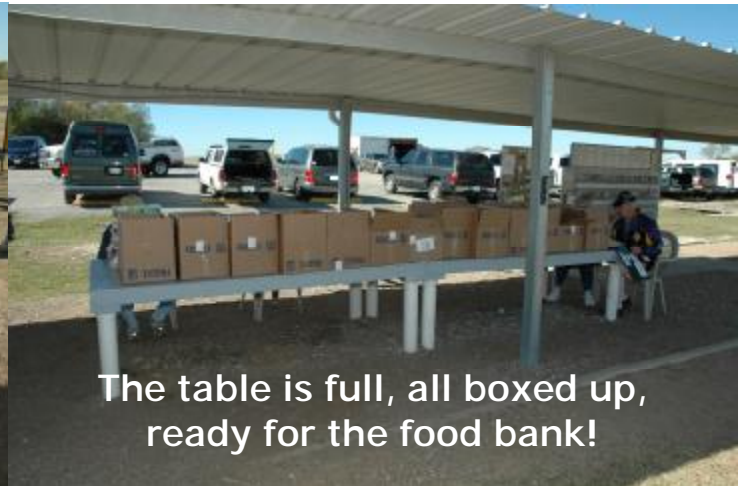
The table is full, all boxed up, ready for the food bank!