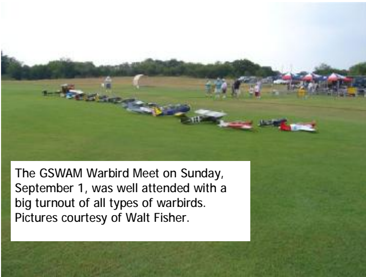
The GSWAM Warbird Meet on Sunday, September 1, was well attended with a big turnout of all types of warbirds.