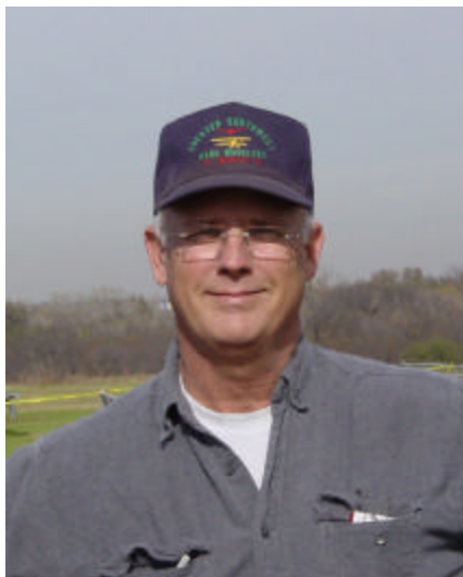
Greetings fellow pilots!